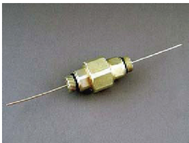
CT-TLC-KS-KS-M Housing To Housing Adapter