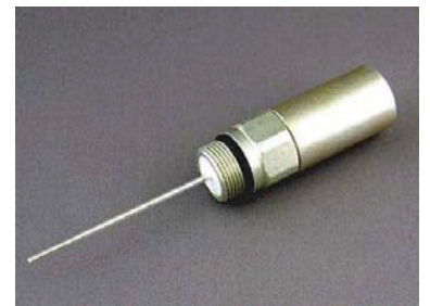
CT-TLC-M Hardline Housing Terminator