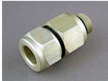
CT-TLC-500-B-DU-03 .500 Feed Through Connector