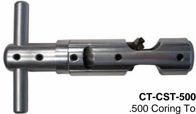
CT-CST-500 .500 Coring Tool