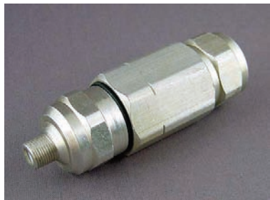
CT-TLC-500-BAFF-DU-03 .500 To F Female Adapter