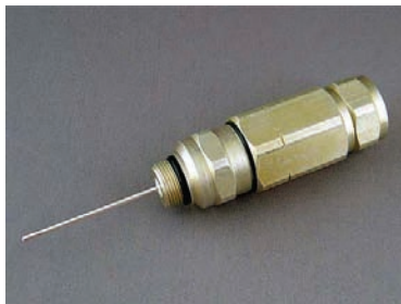
CT-TLC-500-CH-DU-03 .500 Pin Connector