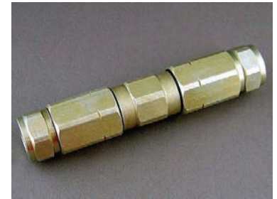
CT-TLC-500-SP-DU-03 .500 In Line Splice