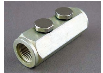
CT-TLC-HSB-A Hardline Splice Block