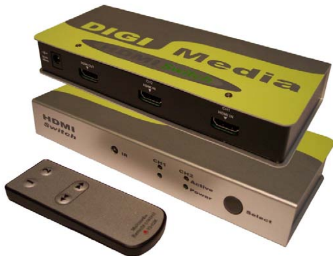
CT-HDMI 2X1 2 Input, 1 Output HDMI Switcher