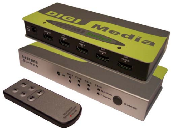
CT-HDMI 4X1 4 Input, 1 Output HDMI Switcher

The CT-HDMI series of HDMI switchers are designed to allow access to multiple HDMI devices such as DVD players and satellite receivers to a single HDMI display. The viewer can switch multiple HDMI inputs to a single display via remote control avoiding the hassles of manually plugging in different HDMI connectors to view different HDMI sources. These units support all HDTV resolution formats including 480i, 480p, 720i, 720p, 1080i and 1080p. Installation requires only the contents of the package (Switcher, power supply, remote, battery and instruction manual) along with male to male HDMI cables of the necessary lengths (sold separately). The CT-HDMI series of HDMI switchers are the perfect addition to any high end home theater system.